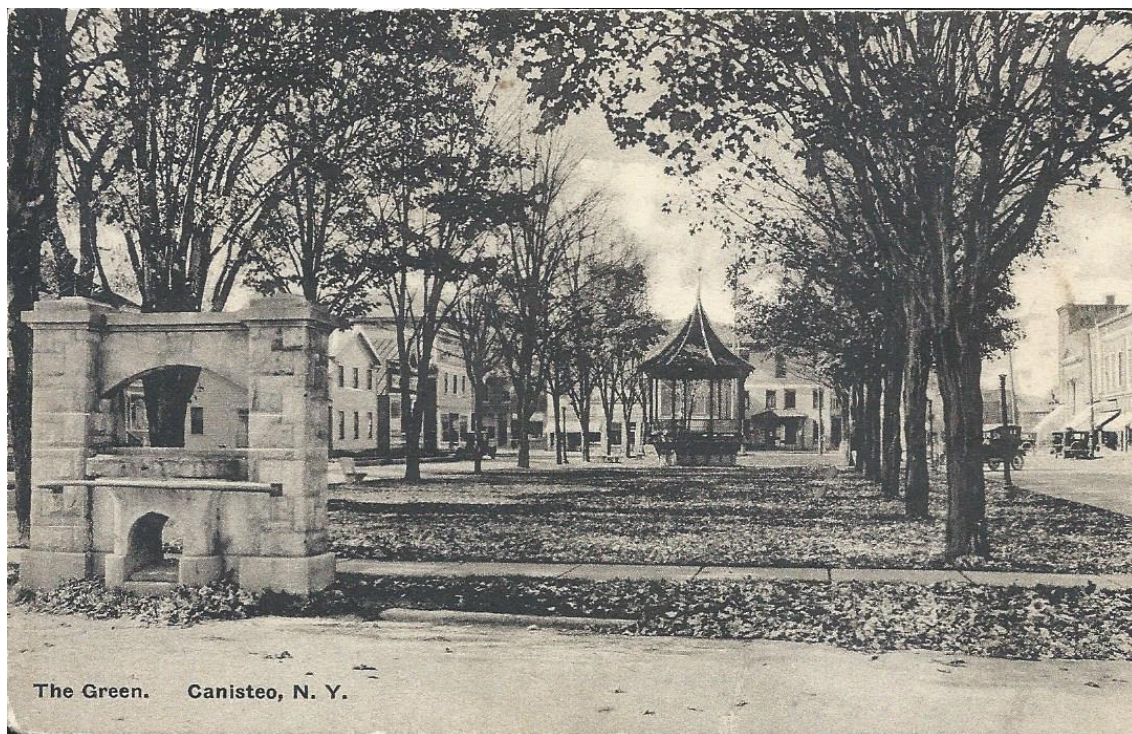
The Green. Canisteo, N. Y.

Kanestio Historical Society 23 Main St., P.O. Box 35 Canisteo, NY 14823