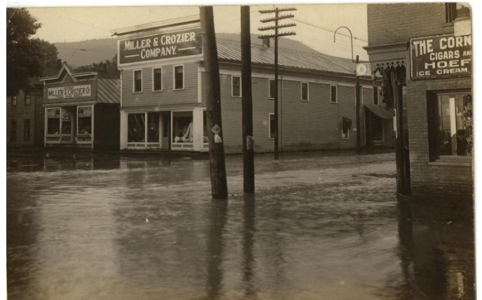
Photo from 1916 Flood