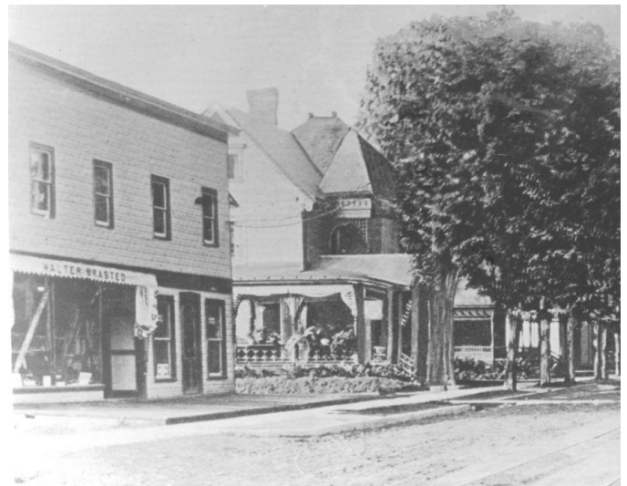
Telegraph Office On Greenwood Street