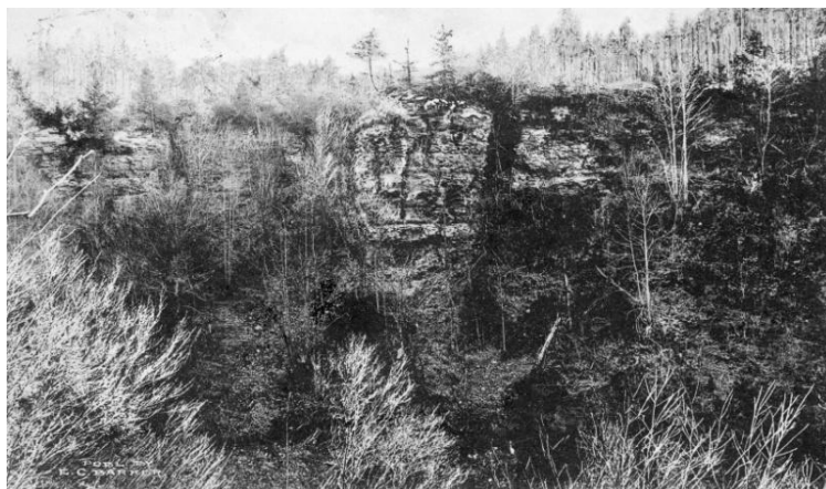
Photo's: Top right Post Card 1892 Above left: postcard of "Gy-Ant-Wa-Chia's Head" Above right