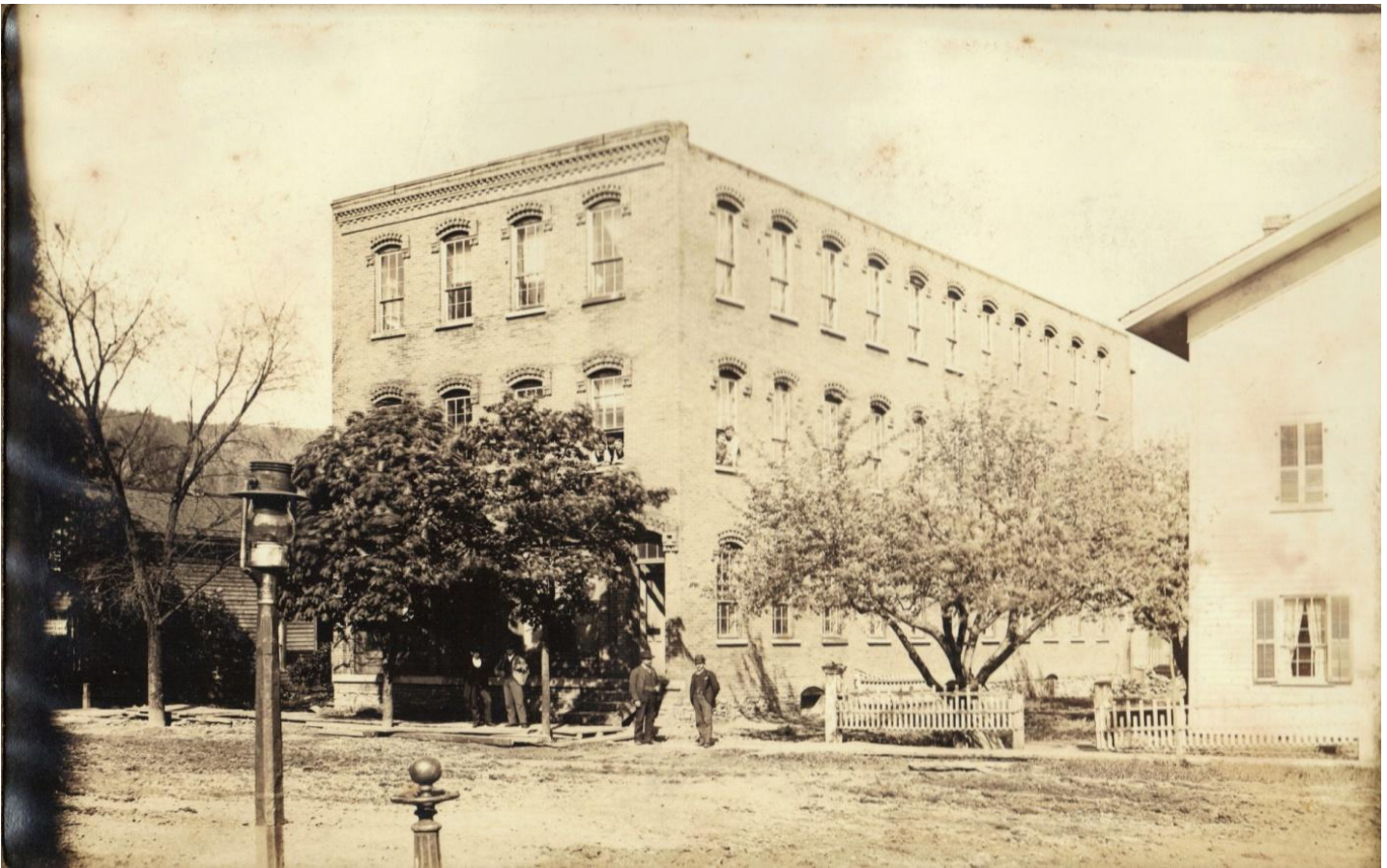
Photo - Davis Shoe Factor (from the Kanestio Historical Society's Files)